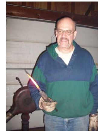
The iron heats to 1700-degrees.