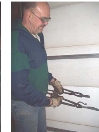
From small scrap of iron to finished cheese knife!