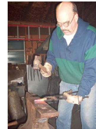
He uses the heat and a hammer to work the iron.