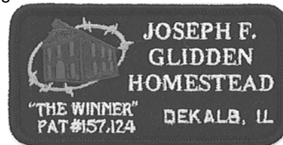
This patch is available for $4 in the Glidden Gift Shop.