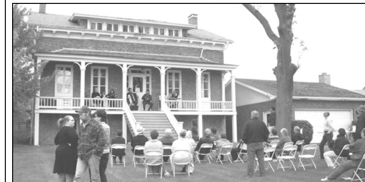
An appreciative crowd listened to "Music on the Porch" as part of the 2008 Open House-Open Barn at the Glidden Homestead. This year's Open House-Open Barn is Sunday, May 17, noon-4 p.m.

Archival, Buildings and Restoration, Events, Finance, Fund Raising, Gardens and Grounds, Grant Requests & Submission, History, Interior Decorating, Membership, Programming, Publicity, Tours/Docents. Certain ad hoc committees are formed to accomplish a specific purpose.