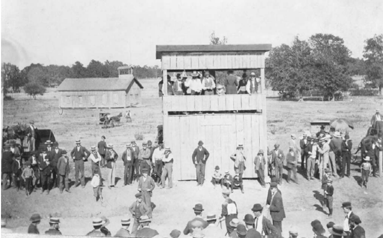
This photo taken Aug. 4, 1894, shows the crowd at a bicycle race at the fairgrounds. Photo is looking east with the Kishwaukee River in the distance. Notice the building located center left with tower on top (possibly a bell tower).