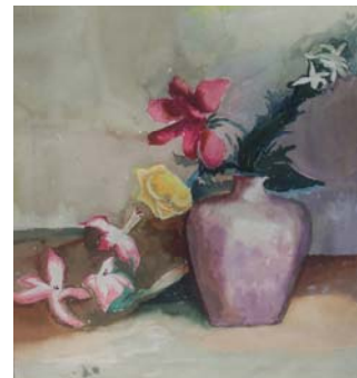
Examples of Mabel's artwork on display at the Homestead.