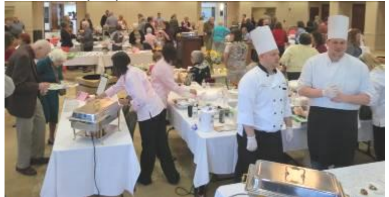
NIU’s Barsema Alumni & Visitors Center was filled with enthusiastic participants for Divas Dish!