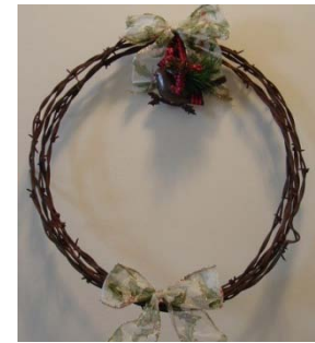
Wreaths - $15