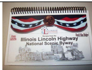
IL Lincoln Highway Cookbook - $18

Featuring the historic Glidden barn and barbed wire. Perfect for shirts, jackets, hats or on its own!