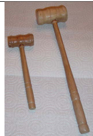
Handmade wooden and gavels $8

Framed copy of Joseph Glidden's Patent for "The Winner," complete with barbed wire sample.