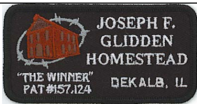
Glidden Homestead patch - $2

Complete with barbed wire and the Glidden Homestead patch.