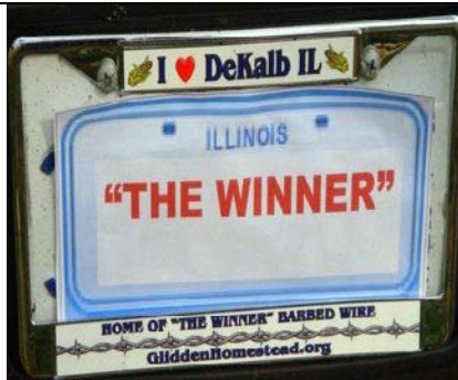
I love DeKalb License Plate Holder