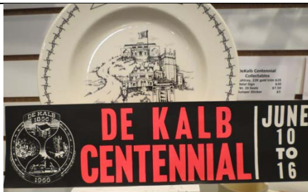
DeKalb Centennial & Sesquicentennial Collectibles

Prices vary Items range from bumper stickers and gold-tipped ceramic ashtrays to metal bumper signs, ceramic plates and tee-shirts.