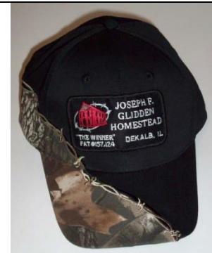
Glidden Cap $12

Complete with barbed wire and the Glidden Homestead patch.