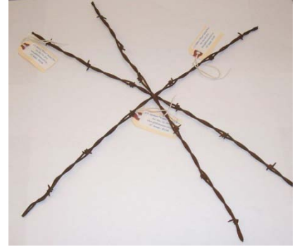
"The Winner" samples - $3 18-inch samples of Glidden's barbed wire "The Winner."

Unique barbed wire items include stars, hats, cactus, crosses and much more