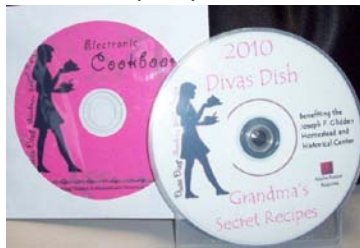
Divas Dish Cookbook CDs $5