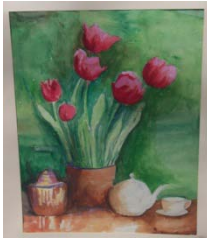
Mabel Glidden's Prints in Cards - $1.50 each or 7 cards - $6