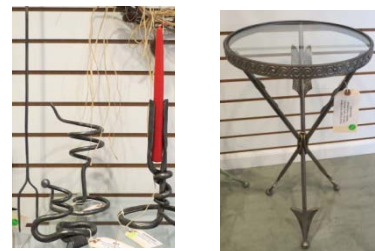
Forged Iron Pieces from Glidden blacksmiths

Featuring recipes and unique artwork depicting buildings along the historic Lincoln Highway, including the Glidden Homestead.