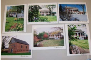
Glidden Photo Cards - $1.50 each