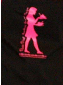
Assorted colors Divas Dish Aprons $12-$15